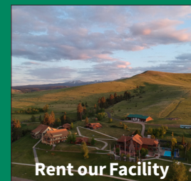
Rent our Facility