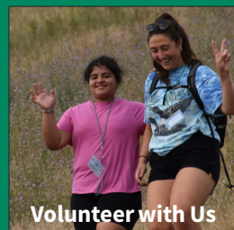
Volunteer with Us