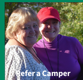
Refer a Camper