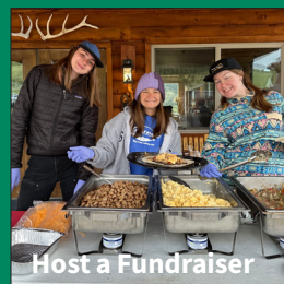
Host a Fundraiser