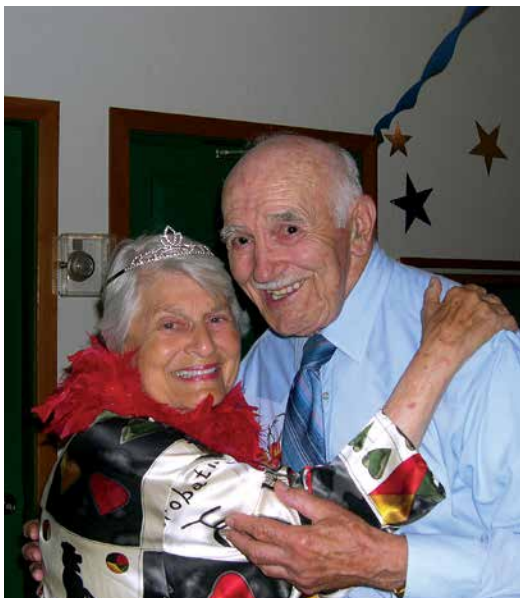
Our founders joining in the fun at Camp.